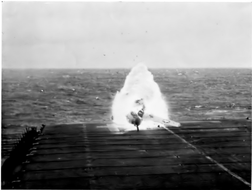
THE PLANE breaks in two at the main fuel cell, the tail section falls back into the water, the nose section continues up the flight deck.