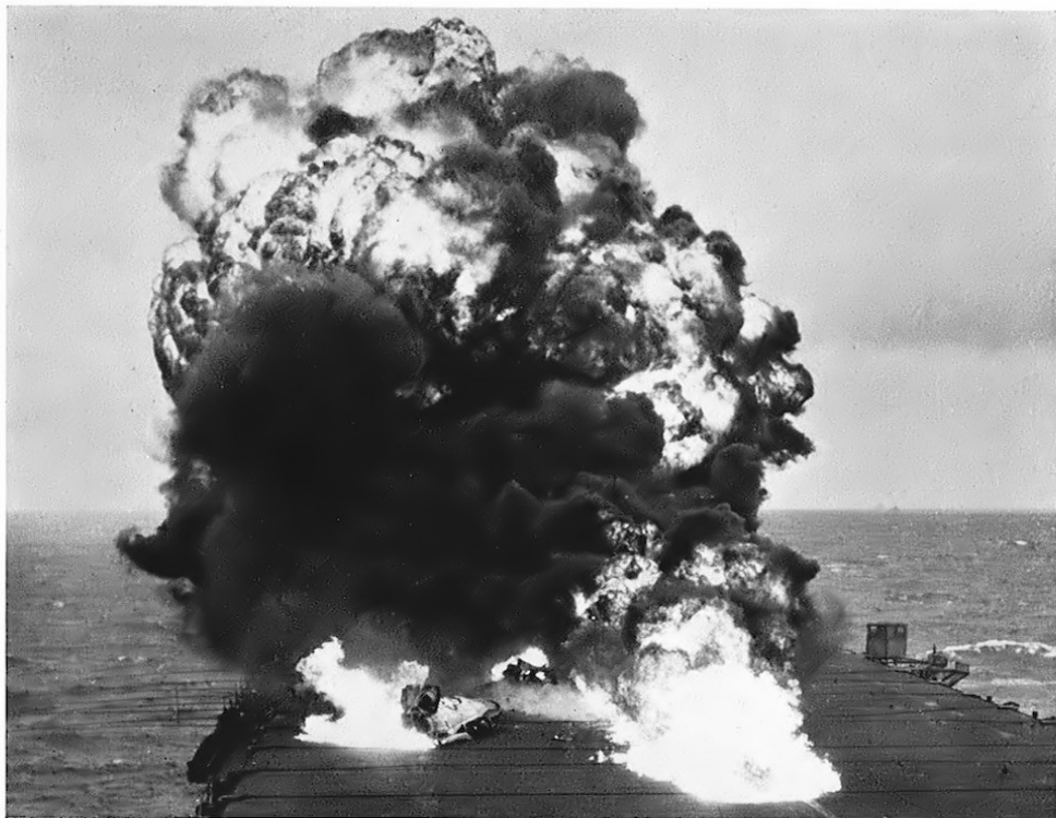
DESTRUCTION of the Banshee is complete as cockpit and pilot come to rest almost completely swallowed up by the blazing fire.