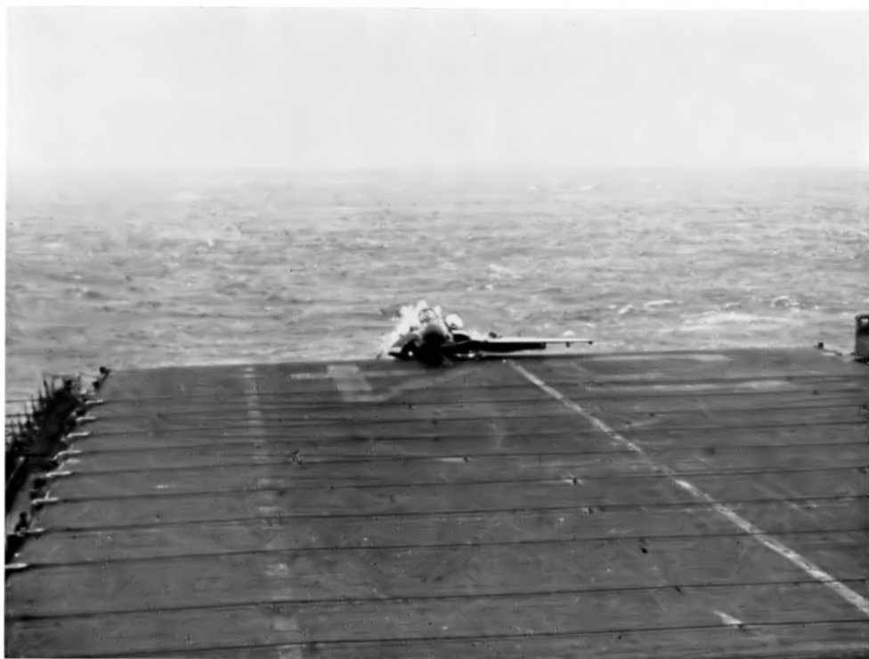
THE F2H3 just makes the flight deck.