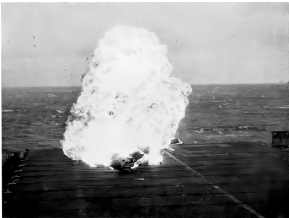
BURNING GASOLINE lights up the stern of the ship as the plane is completely demolished except for the nose and cockpit.