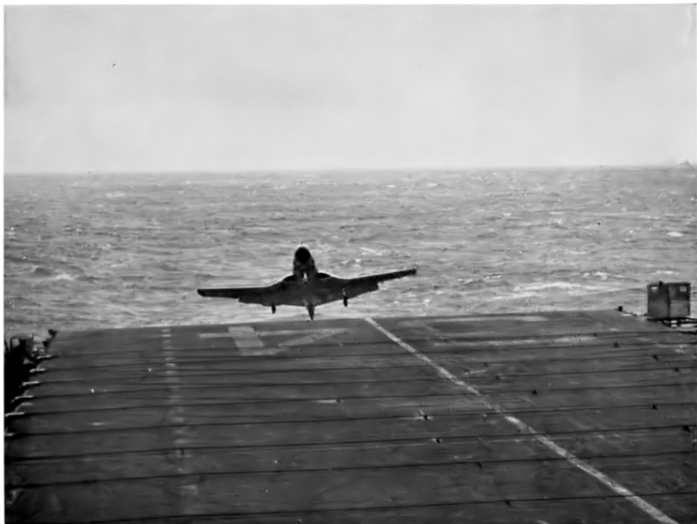
BANSHEE loses power on a wave off and starts to settle into the fantail.